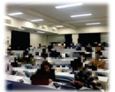
Figure 3: Session1 research