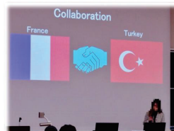
Figure 6: Session4 presentation