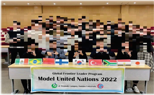
Figure 1: Group photo