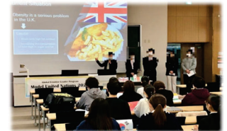
Figure 7: Session4 presentation